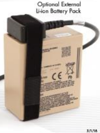
Optional External Li-ion Battery Pack