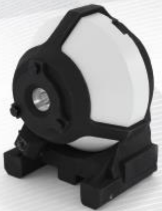
Lead (Pb) Pinhole Imaging Aperture 60-degree Field of View