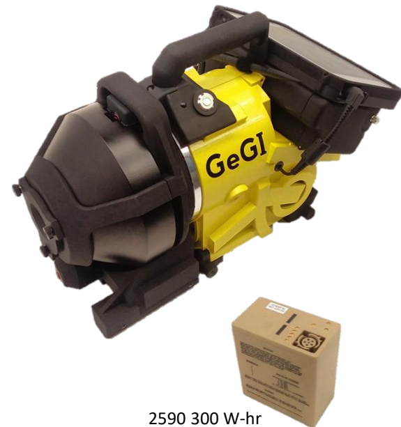
2590 300 W-hr External battery