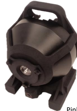
Pinhole Imaging Aperture