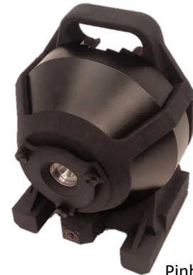
Pinhole Imaging Aperture