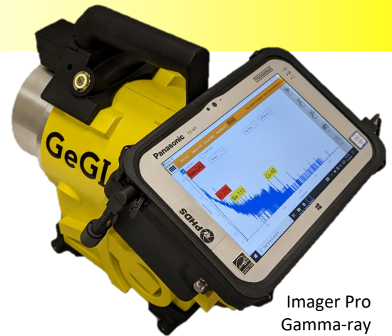
Imager Pro Gamma-ray Imaging Software