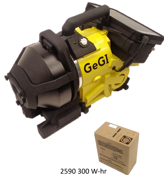
2590 300 W-hr External battery